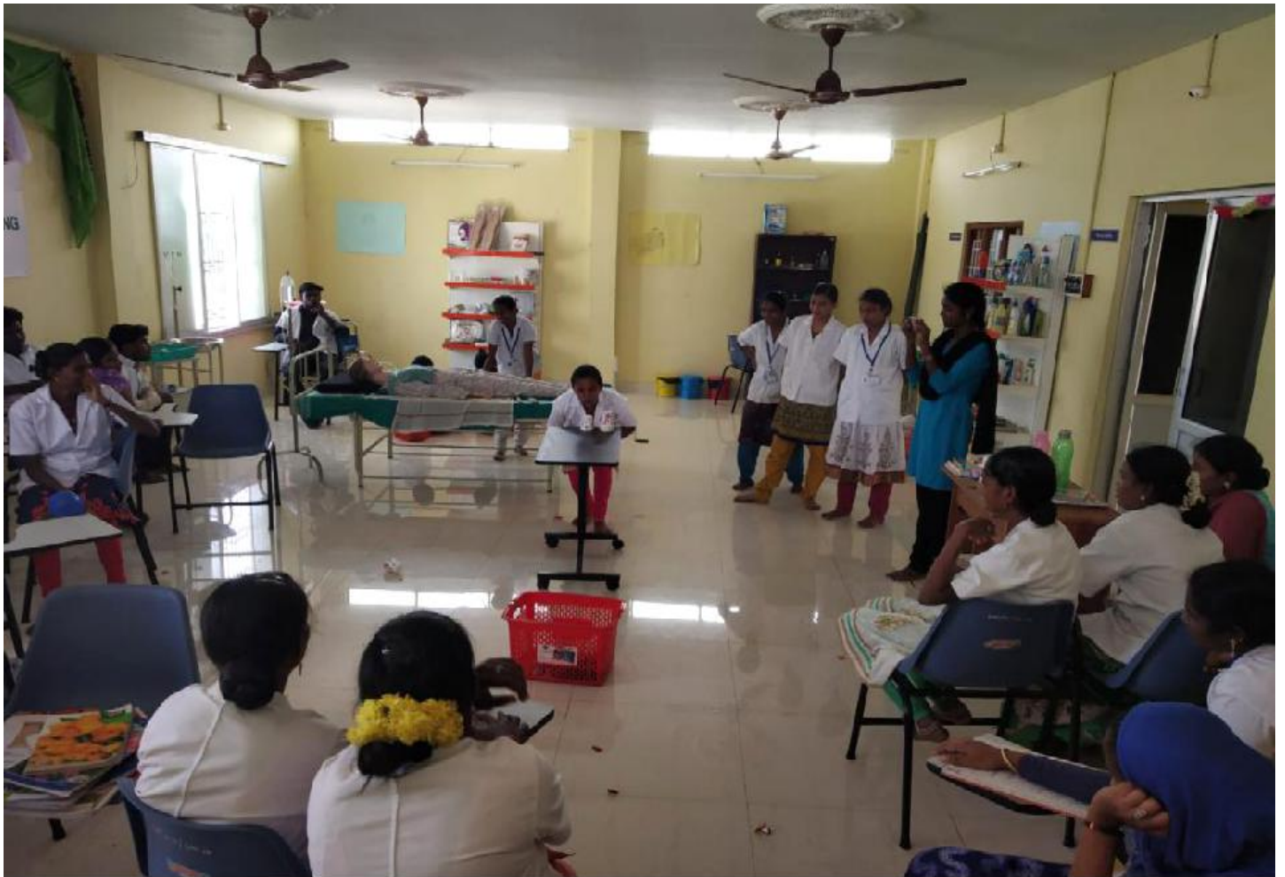
PONGAL CELEBRATION AT SKILL TRAINING CENTRE